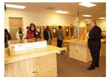
Open house attendees tour the Weatherization Training Center

"Working in partnership with the San Bernardino County communities to support low-income residents in achieving self-sufficiency"