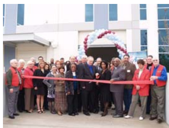
Staff and guests gather for the ribbon cutting