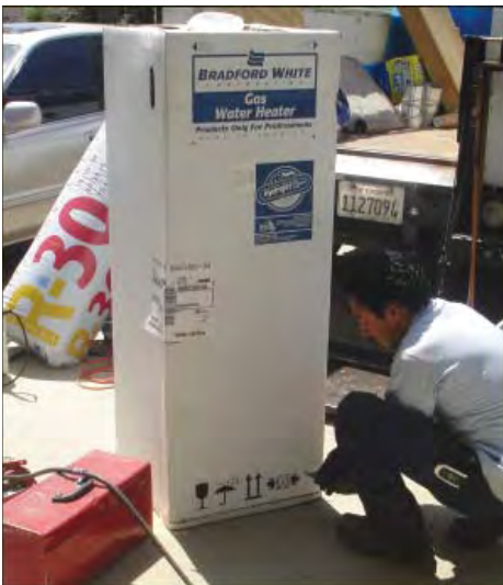
A CAPSBC Technician prepares an energy efficient gas water heater for installation.

New energy efficient refrigerators, evaporative coolers, furnaces, shower heads, and water aerators were installed, water heaters were fitted for blankets and pipes were wrapped, broken glass windows were replaced, carbon monoxide gas detectors were installed and old equipment was hauled away for recycling. Many of the residents who received the equipment and services are senior citizens who could not otherwise afford these home investments that will help reduce their energy bills in the future. With the heat of summer in full swing, it has been a timely effort for these San Bernardino County residents.